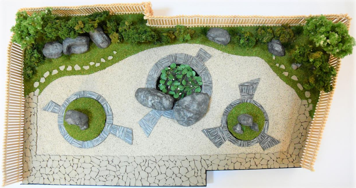
The Iwakura Garden – Form