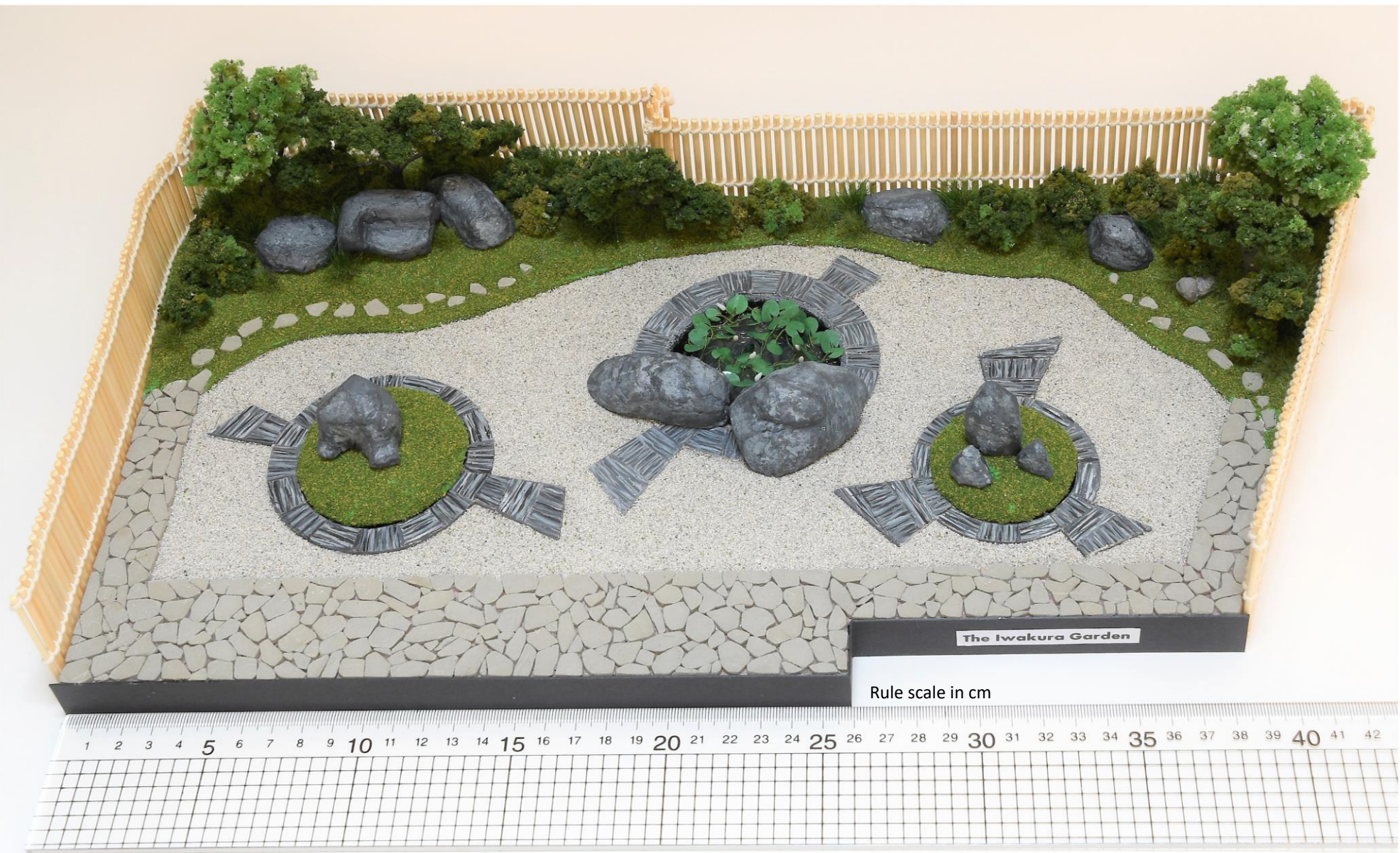
The Iwakura Garden - Model Scale 1:45